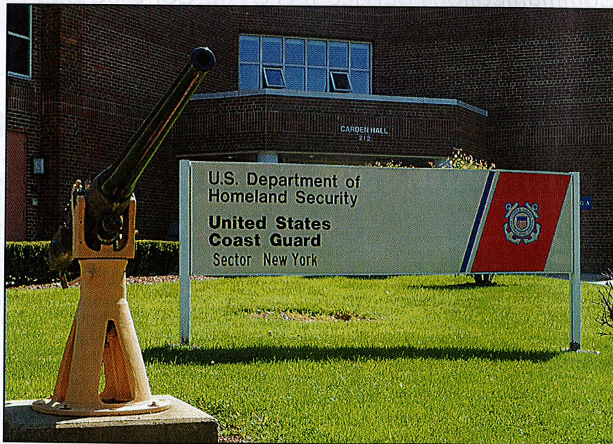
The Coast Guard building at Ft. Wadsworth on Staten Island where all the various emergency agencies monitored the progress of the cross-city bike tour.