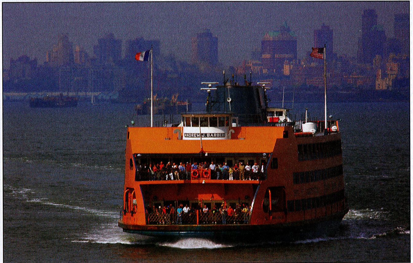
The Staten Island Ferry in busy New York Harbor.

At a public service event, the New York City Amateur Radio Emergency Communications Service (NYC-ARECS) used an APRS/AIS network to track the status of the world famous Staten Island Ferry to help manage the flow of heavy pedestrian movement.