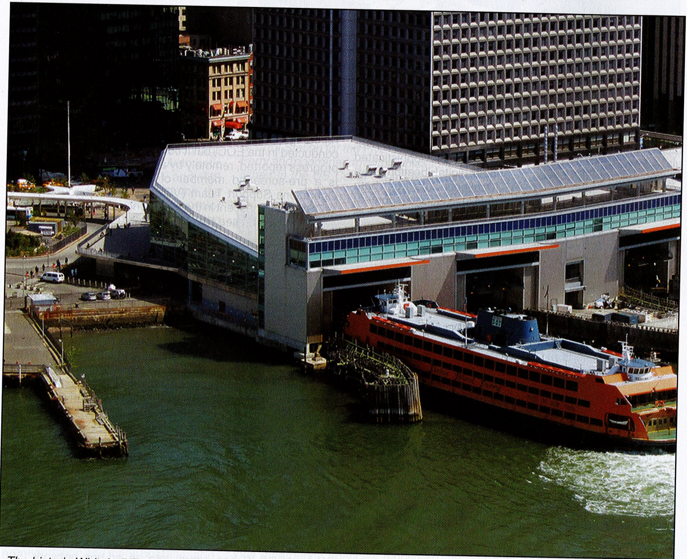
The historic Whitehall Terminal for the Staten Island Ferry at the southern tip of Manhattan.